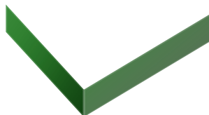
Figure 1. Descriptive summary for strongest musician role models.